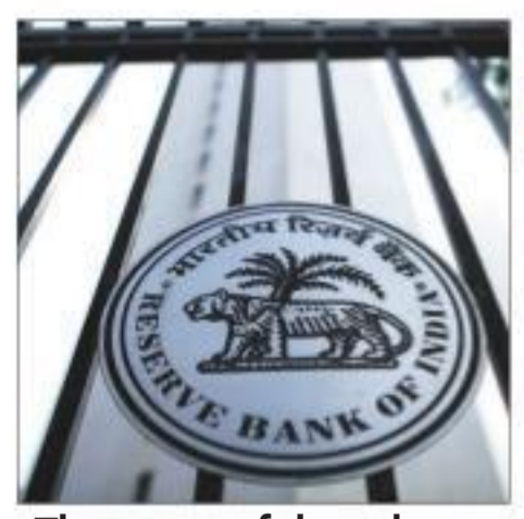
The terms of the scheme have also been tweaked

No interest subvention would be admissible for any period during which an account remains NPA