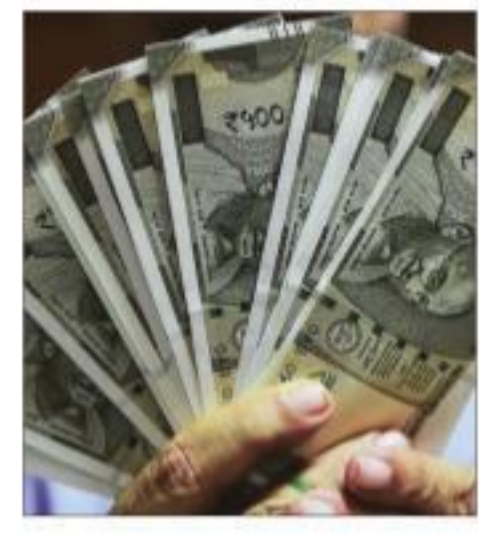
lal Oswal analyst report said.

"The sharp decline in disbursement volumes has come as a bit of a disappointment in the context of healthy trends witnessed by peers such as HDFC. Nevertheless, we believe it is a good strategy to curtail disbursements in this uncertain environment. In our opinion, this stance is likely to continue for another quarter or so," a Motilal Oswal analyst report said. Bajaj Finance's assets under management as of September 30, 2020 stood at approximately ₹137,300 crore, compared with ₹135,533 crore as